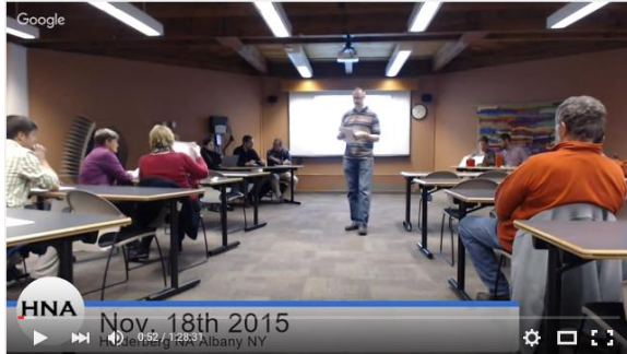
A screenshot of the recorded version of the meeting

The most recent meeting of the HNA was held on November 18. This was the first meeting that was broadcast live over the internet for people who could not attend. It will also be archived for future viewing. There were some concerns about the quality of the sound on the broadcast, which the board will work to address.