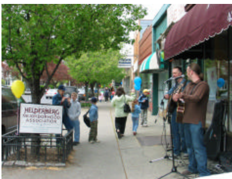
Spring Spree 2006